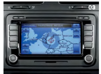
03 RNS 510 DVD touch-screen navigation/radio system.

When it comes to in-car entertainment systems and communications packages, those looking to install a technologically advanced or upgraded system are spoilt for choice. Whether you require the latest navigation system with integrated voice control or a digital radio receiver, these factory-fitted options provide state-of-the-art technology and connectivity. Choose the system that best meets your needs, then sit back and enjoy the benefits.