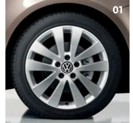
01 'Seattle' 7J x 17 alloys wheels.

Add a touch of style and personality with this great choice of alloys. Alloys add a distinctively sporting look to your car, carefully chosen to enhance the exterior styling of every model, these options give you plenty of opportunity to express your individuality and transform the appearance of your Golf Plus.