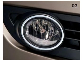
02 Front fog lights.

The exterior styling of a car is not only an expression of its personality, but makes a powerful statement about your own individuality and taste. These factory-fitted options provide an easy and effective way to create a striking visual appearance with great aesthetic appeal, while enjoying some important practical benefits. From Special paint to front fog lights, choose the options best suited to your needs and enhance not only your Golf Plus's exterior looks, but your driving experience too.